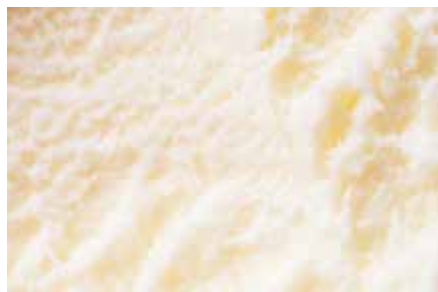
A close look at ice cream shows its porous structure.

sion—a combination of two liquids that do not normally mix together. Instead, one of the liquids is dispersed throughout the other. In ice cream, liquid particles of fat—called fat globules—are spread throughout a mixture of water, sugar, and ice, along with air bubbles (Fig. 1). If you examine ice cream closely, you can see that the structure is porous. A typical air pocket in ice cream will be about one-tenth of a millimeter across. The presence of air means that ice cream is also a foam. Other