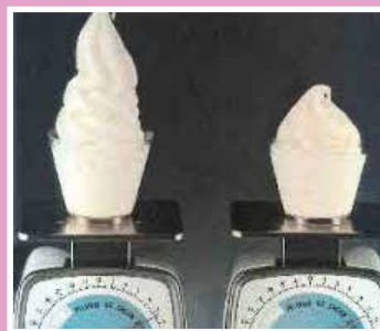
The amount of air, known as overrun, in the dish of soft-serve ice cream on the left is 65%, versus 35% on the right.

The amount of air also has a huge effect on the density of the ice cream. A gallon (3.8 liters) of ice cream must weigh at least 4.5 pounds, making the minimum density 0.54 gram per milliliter (or 540 grams per liter). Better brands have higher densities—up to 0.9 grams per milliliter. The next time you visit a grocery store, compare cheaper and more expensive brands by holding a container in each hand—you should be able to notice a difference. Then read the net weight on the