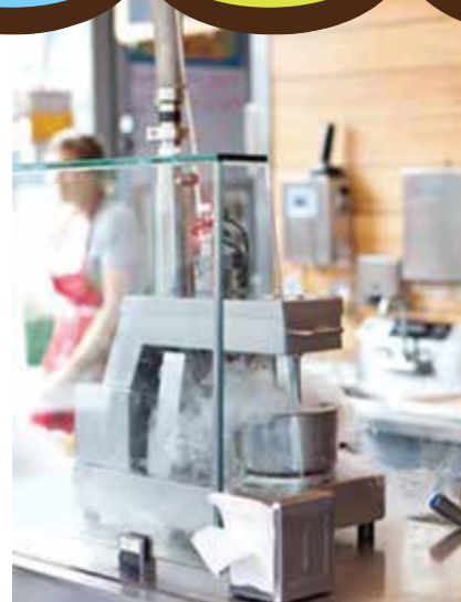
Ice cream shops serving desserts made with liquid nitrogen are unique and very popular.

Note: If you are concerned about the ambiguity of these answers, now you know why ice cream historians are still arguing about the origins of ice cream!